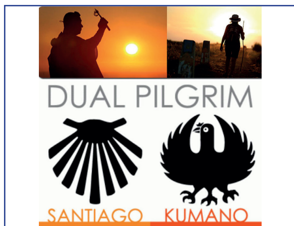
Figure 3: The Symbols of the routes of Santiago de Compostela and Kumano Kodo

The involvement of local communities in the management and conservation of heritage is vital (Nicholas, Thapa and Ko, 2009; Timothy, 2011; Jimura, 2016). While developing a cultural route, various factors, tangible, intangible resources and different agencies and bodies should necessarily be taken into consideration. For