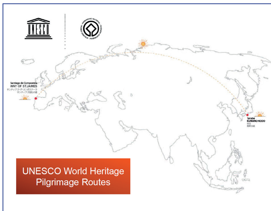
Map 2: The pilgrimages Santiago de Compostela in Spain and Kumano Kondo in Japan