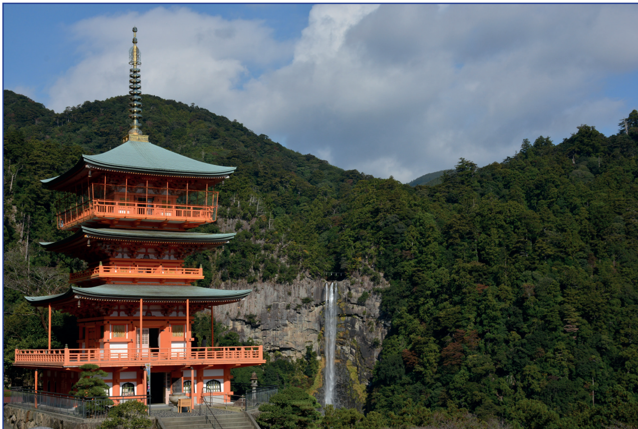
Figure 2: Sanjūdō pagoda and Nachi falls at Kumano Nachi Taisha