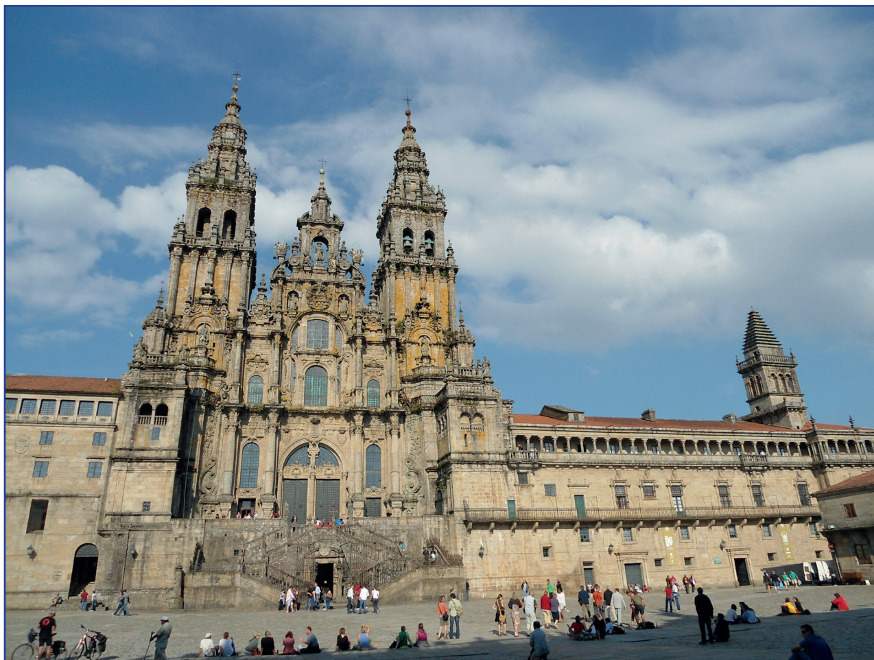
Figure 1: The Cathedral of St James is a Major Pilgrimage Site