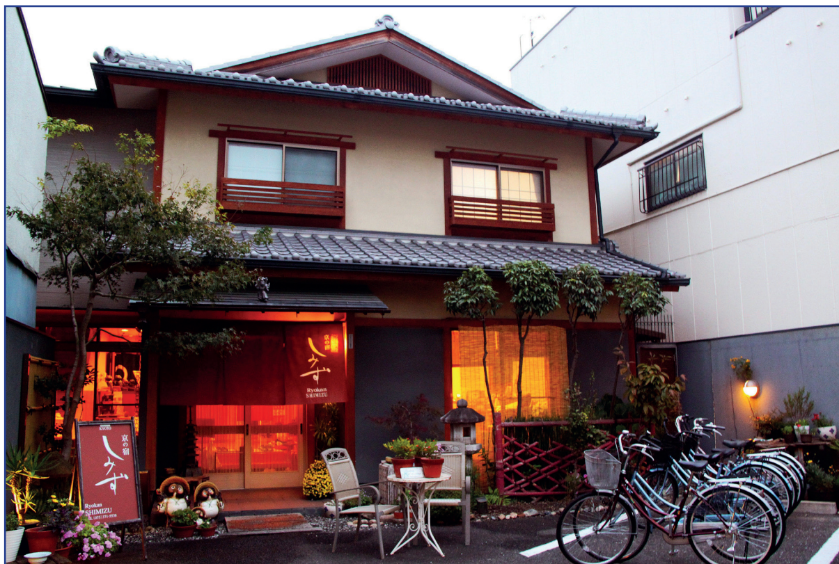
Figure 4: A Typical Japanese Ryokan