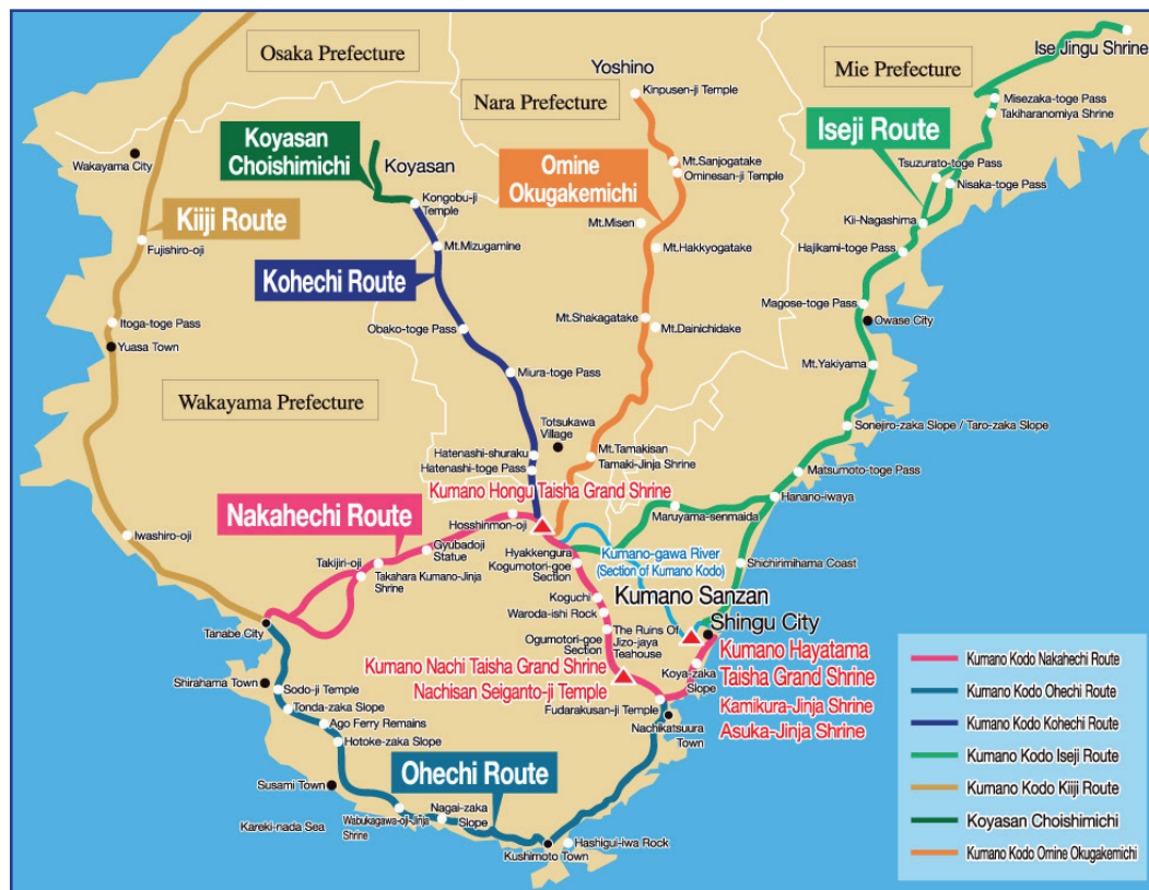
Map 1: The Kumano Kodo cultural-religious routes